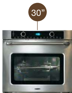
Single Self Clean Wall Oven MWOV301ES