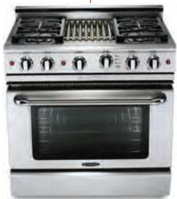
Self Clean GSCR36