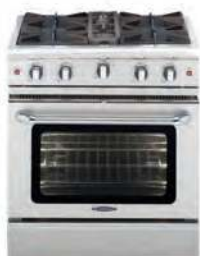
Manual Clean MCOR30