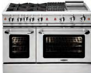
Manual Clean MCOR48

With a design that perfectly blends the look of commercial & residential, the Culinarian provides optimal heat delivery, power & function.