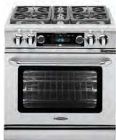
Self Clean CSB30