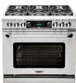
Self Clean CSB36