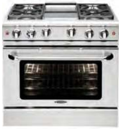
Manual Clean MCR36