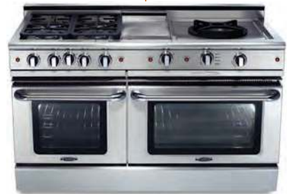
Self Clean GSCR60