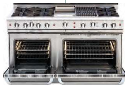
Self Clean CGSR60