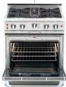
Self Clean CGSR30