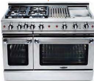
Self Clean GSCR48