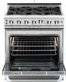
Self Clean CGSR36