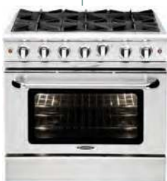
Manual Clean MCOR36