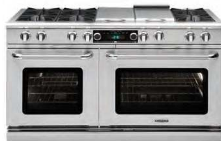
Self Clean COB60