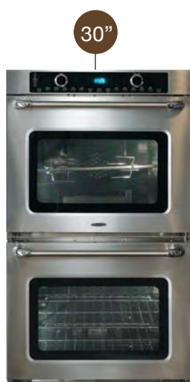
Double Self Clean Wall Oven MWOV302ES