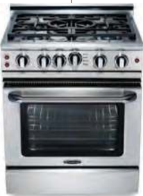
Self Clean GSCR30