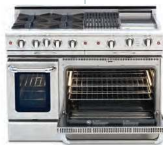
Self Clean CGSR48