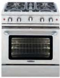
Manual Clean MCR30