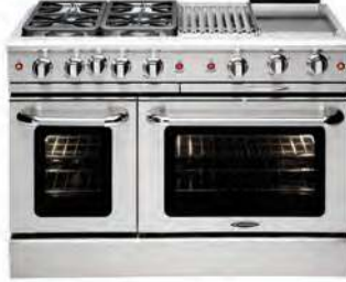
Manual Clean MCR48

Offering the largest oven capacity in it's class, the 30" Precision manual clean range offers an impressive 4.9 cu. ft. interior capacity.