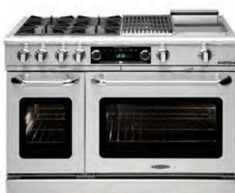
Self Clean COB48